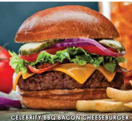
CELEBRITY BBQ BACON CHEESEBURGER