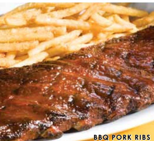
BBQ PORK RIBS

Tender hickory-smoked St. Louis-style ribs smothered with our tangy, sweet barbeque sauce and served with french fries