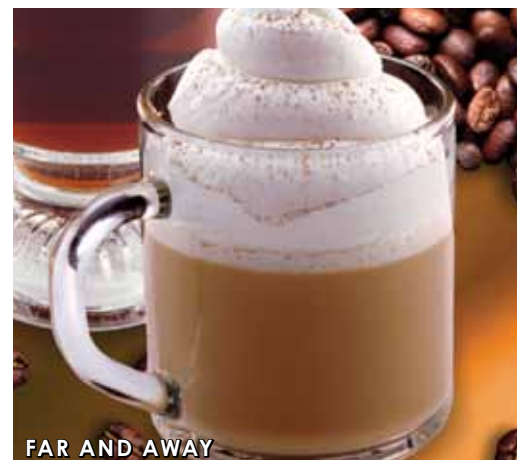
FAR AND AWAY