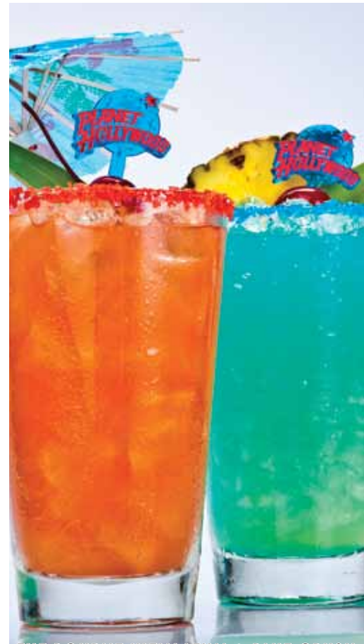
THE BOURNE ULTIMATUM & BLUE CRUSH

The Super Sour is a combination of Midori's sweetness with the bright lip puckering tartness of fresh lemon juice and sour. Rimmed with a tasty super sour sugar and Lemon Roxi Rox that will take your taste buds to a whole new level!