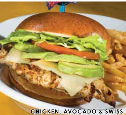
CHICKEN, AVOCADO & SWISS