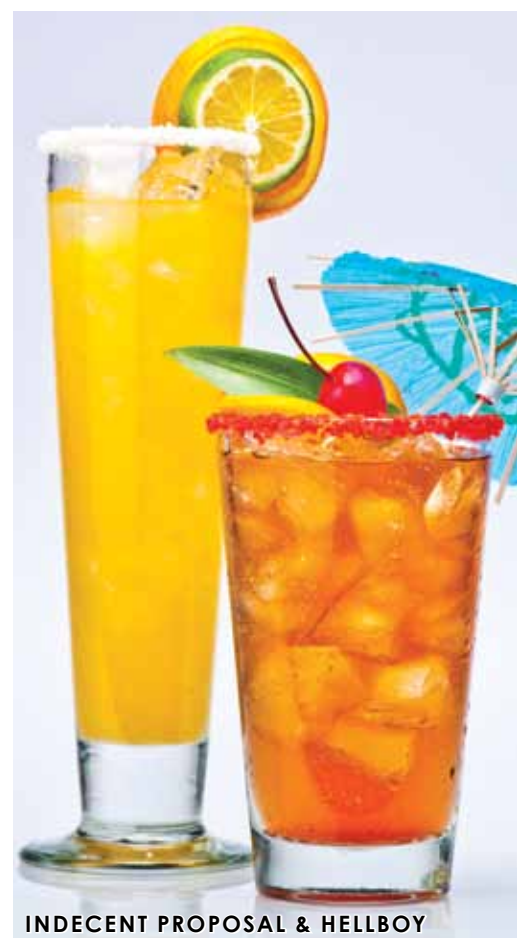
INDECENT PROPOSAL & HELLBOY