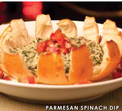
PARMESAN SPINACH DIP