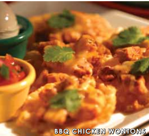
BBQ CHICKEN WONTONS