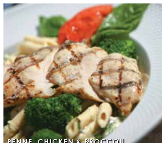
PENNE, CHICKEN & BROCCOLI