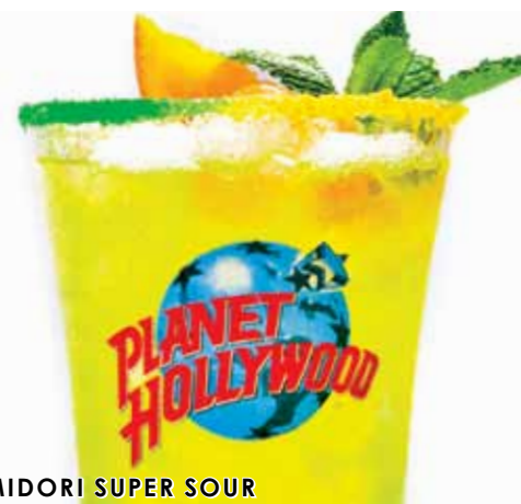
MIDORI SUPER SOUR