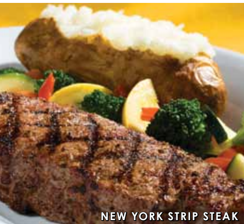
NEW YORK STRIP STEAK